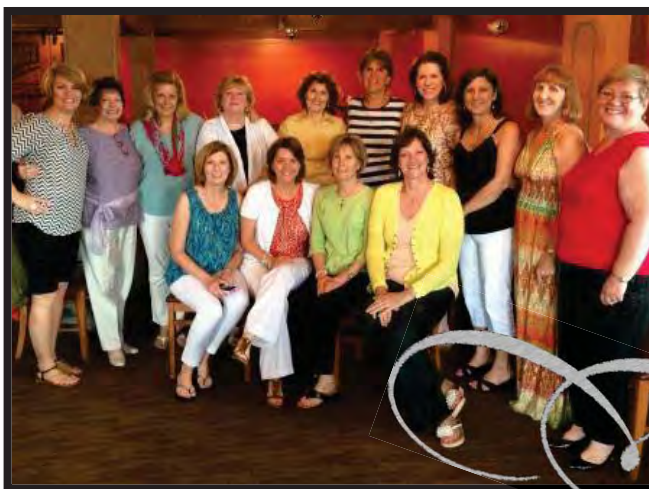
Psi Zetas from the 60s, 70s, 80s, and 90s gathered in July for a Happy Hour Reunion at Molina's.