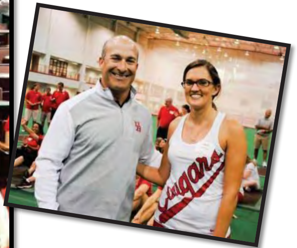
Nine Chi Omegas took part in the University of Houston's Women's Football 101 in late July.